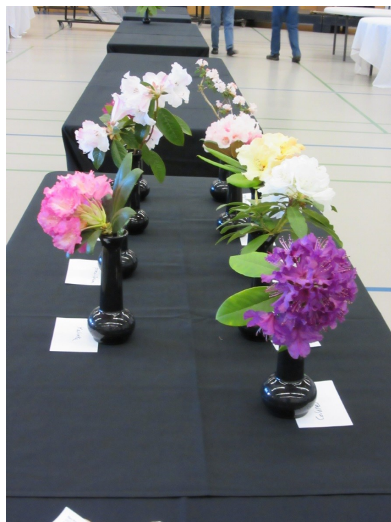
Decorations for the dining room