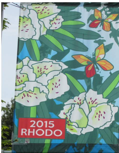
One of the banners for the Convention on display in Sidney.

A huge bouquet of 'Thank Yous' to all who spent the last two years organizing and hosting this incredible conference. We are blessed to live on such a beautiful, rhodo friendly island.