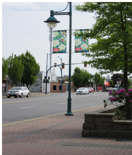
The streets of Sidney during the ARS Rhododendron Convention.