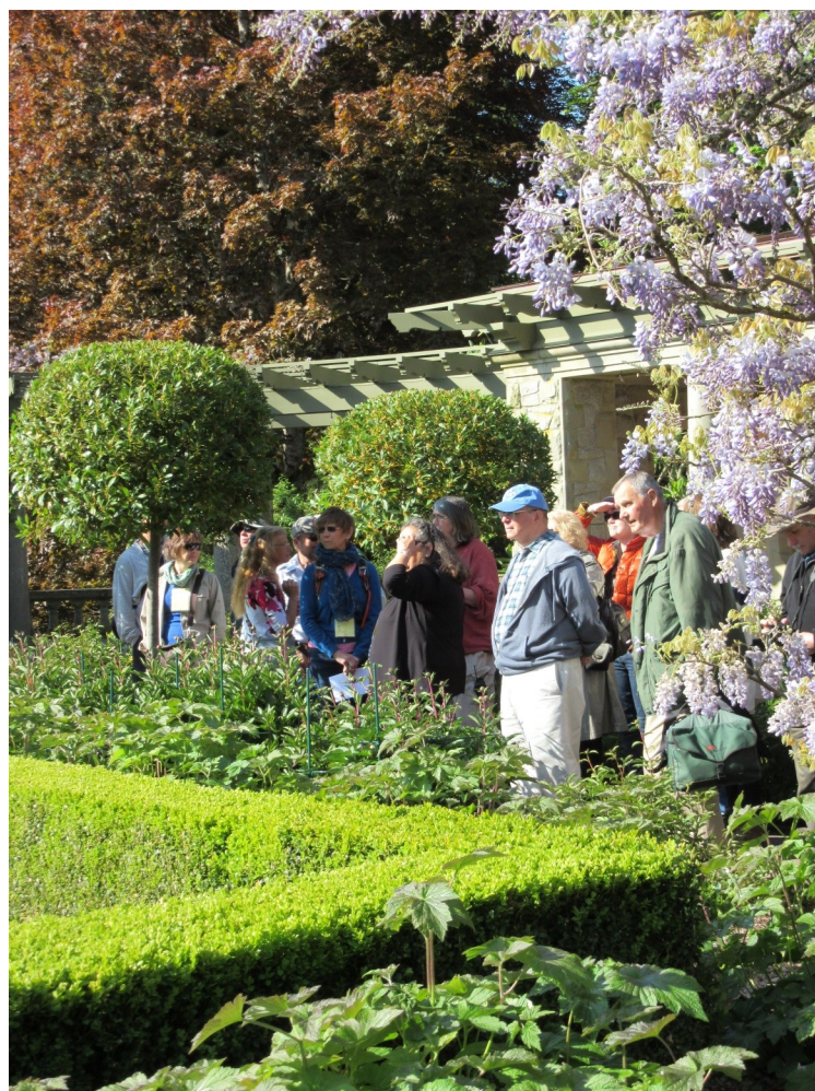
ARS Conventioneers on the May 8 Garden Tour to Royal Roads University