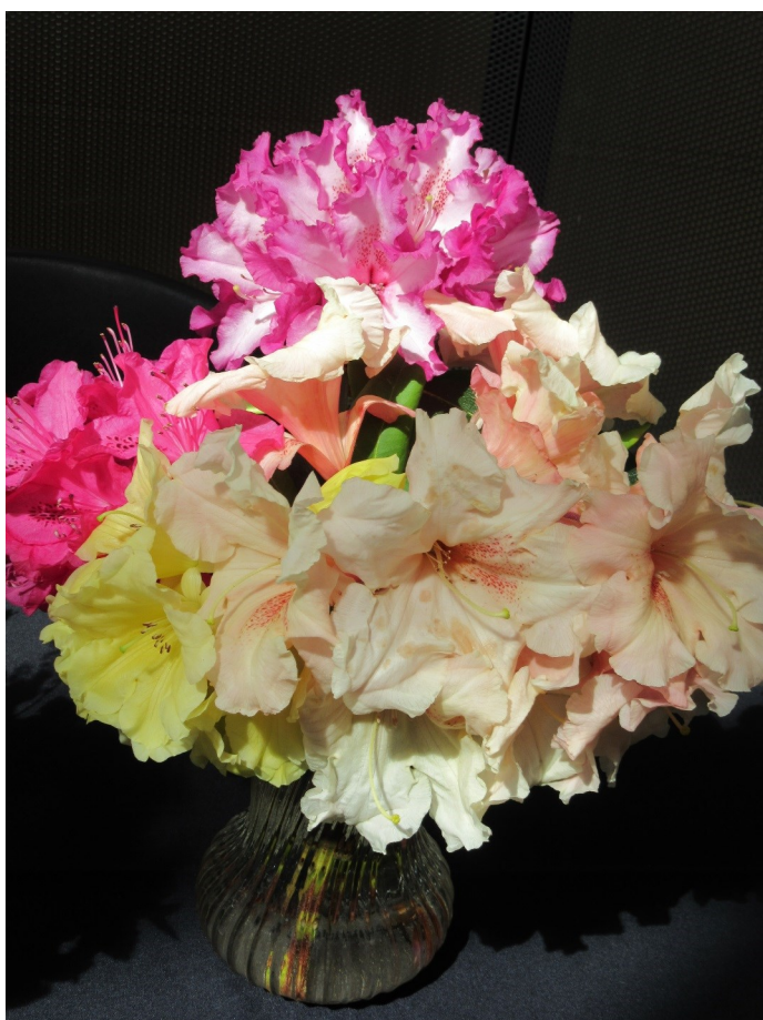
A gorgeous display of rhododendrons