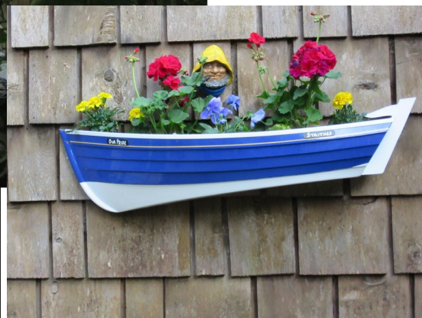
Various of Peter Lewis's unique water fountains, one of his oriental themed statues and a 'flower' boat model on a shed wall.